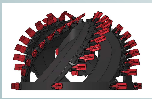
Cutter head with teeth connected to WING adapter