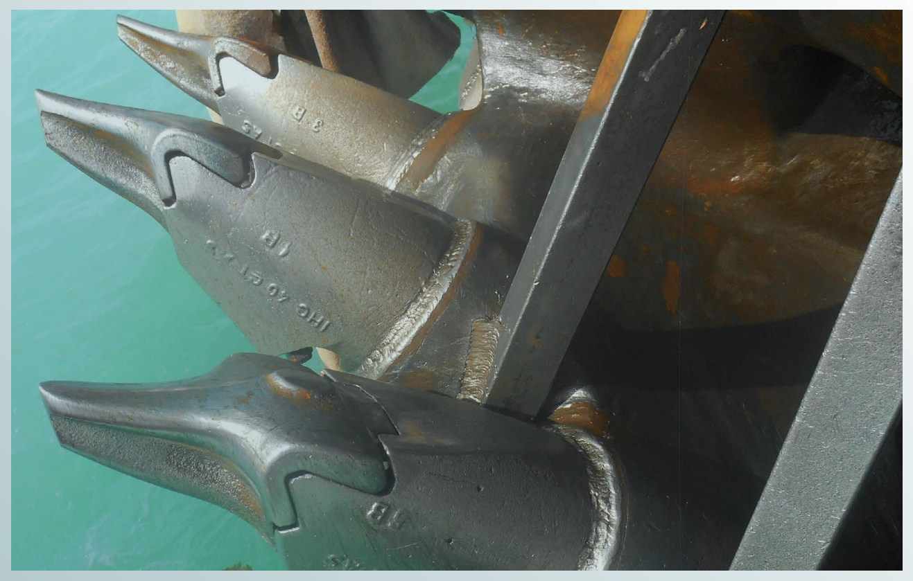
Wear is always perpendicular to the cutting area. Although worn almost halfway, the teeth show a sharp and crisp edge.